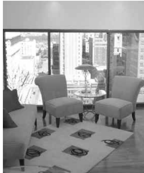
Submitted photo ( )

The WallStreet Tower experience begins with a video that showcases the sense of community planned for the condominium complex. The sales office includes a display area where homebuyers may meet with a designer and customize their selections. The building features granite floors, stainless steel accents, and marble walls in the common areas. Amenities of WallStreet will include a rooftop pool complex with a social area, elevators, club room, fitness center, business center, key-card controlled access to the parking garage,